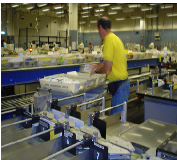
SWEEPING CFS MACHINE

The Clerk is able to adjust the weight of mail which is lifted or carried at any time, at his/her discretion and as desired for comfort.