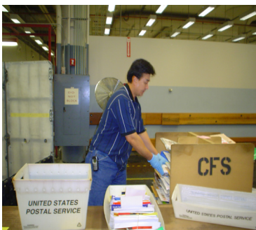
STAGING (SORTING) MAIL