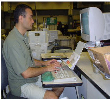
KEYING NON-MACHINABLE MAIL

The Clerk sits (or stands with “rest bar” support, as desired for comfort, when keying non-machinable mail) at a computer console. The Clerk keys in forwarding information for each mail piece at a self-paced rate. Periodic hand and wrist “stretch breaks” are encouraged.